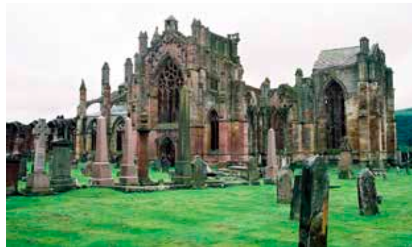
Melrose Abbey, Borderlands of Scotland. St. Andrew's Academy students here visited the burial site of the heart of Robert the Bruce, King of Scotland.