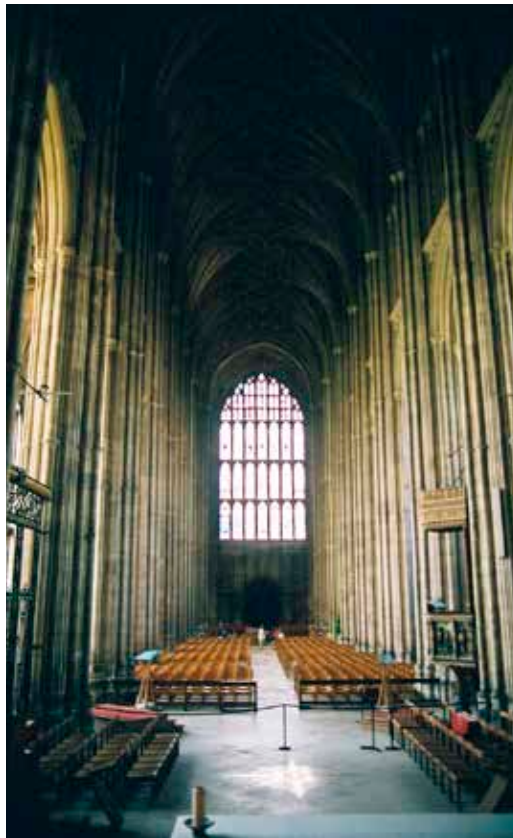
The Nave of Canterbury Cathedral. St. Andrew's Students sat at the front, right of the picture for the service of Holy Communion

"Light and liberty go together," said Thomas Jefferson. He was talking of education. The educated man will stay the free man. But he spoke more truth than he knew. For the light of the Gospel shining in men's hearts is the beginning of their true education and the Gospel of Jesus sets men free. The more we know of the Gospel and the more we apply God's Gospel in our life, the more free we are to do God's will; the less entangled we are by besetting sin.